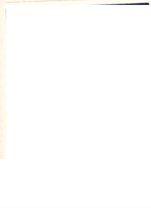
(Wife of applicant)